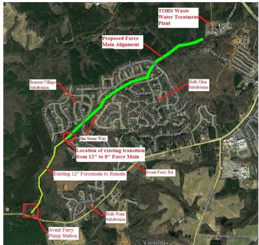
Overview of the force main project area

A portion of the undeveloped greenway between Holly Thorn Trace and Elm Stone Way will be closed for approximately 4 to 6 weeks. Some rear yard fences may need to be removed during construction. A Town representative will coordinate with individual property owners prior to fence removal. Construction noises, including back-up beepers and heavy equipment engines, may be heard during work hours, 7 a.m.– 6 p.m., Monday through Friday on properties adjacent to the construction area. Some construction could occur on Saturdays between 8 a.m. and 6 p.m. if the project is behind schedule due to delays beyond the contractor's control, such as unforeseen weather events.